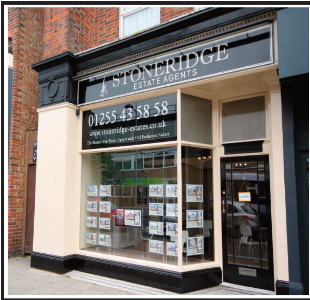
CLACTON OFFICE - No. 1 Arcade Buildings, Station Road, Clacton on Sea