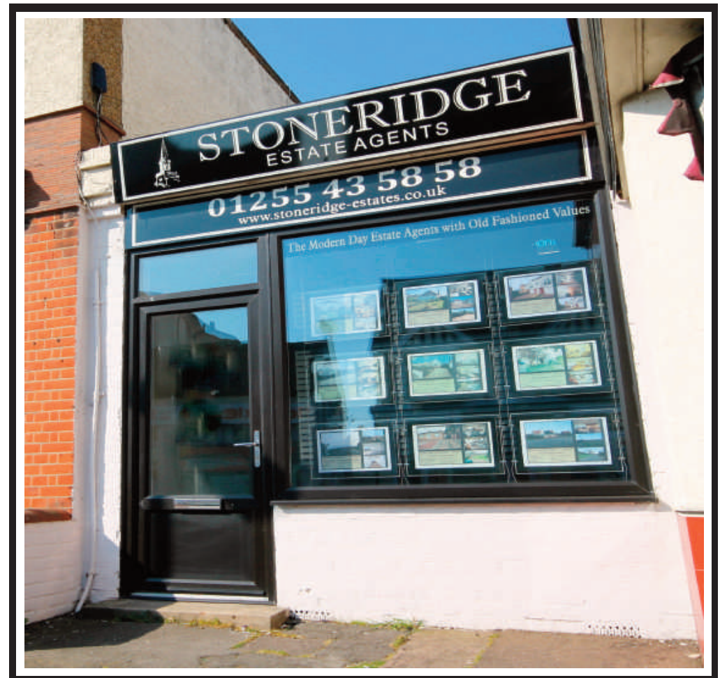
HOLLAND OFFICE - 37 Frinton Road, Holland on Sea

Visit our website at www.stoneridge-estates.co.uk or email us at info@stoneridge-estates.co.uk